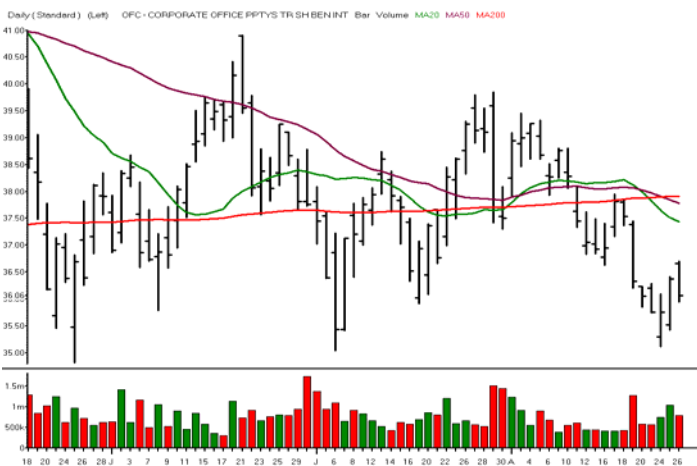
CORPORATE OFFICE PPTYS TR SH BEN INT