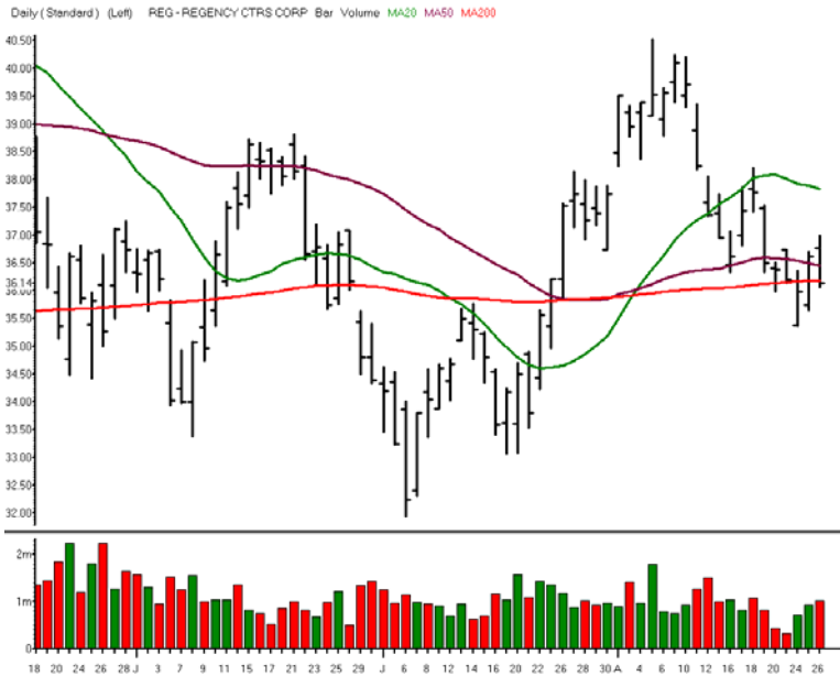
REGENCY CTRS CORP

Symbol REG Sector RETAIL REIT'S Sector Symbol $DJR.X Pattern Switch Hitter Position Short Entry 35.97 Target 35.65