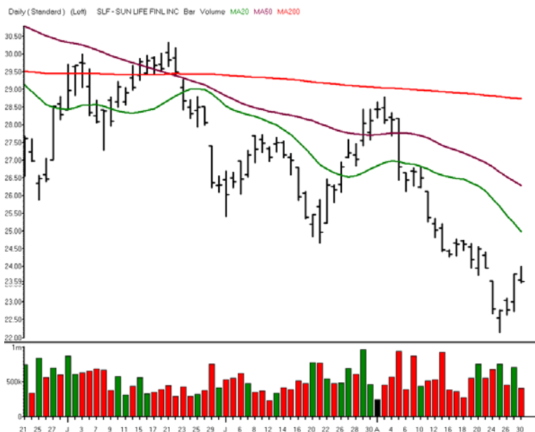
SUN LIFE FINL INC