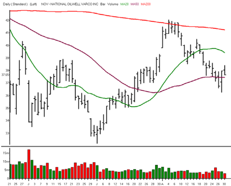
NATIONAL OILWELL VARCO INC