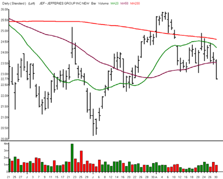
JEFFERIES GROUP INC NEW

Symbol JEF Sector CAPITAL MARKETS Sector Symbol $XBD.X Pattern Fast Ball Position Short Entry 22.66 Target 22.37