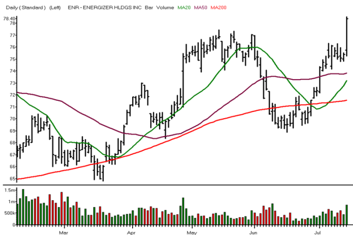
ENERGIZER HLDGS INC