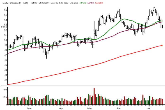
BMC SOFTWARE INC