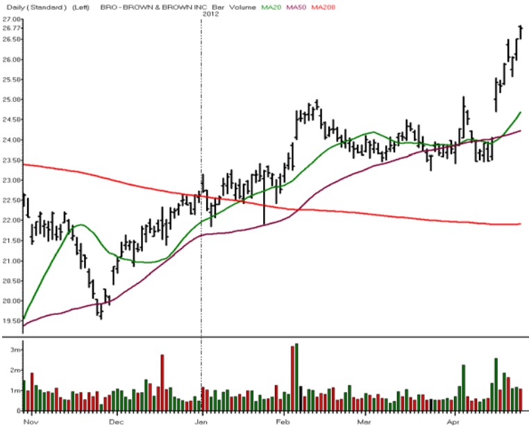
BROWN & BROWN INC