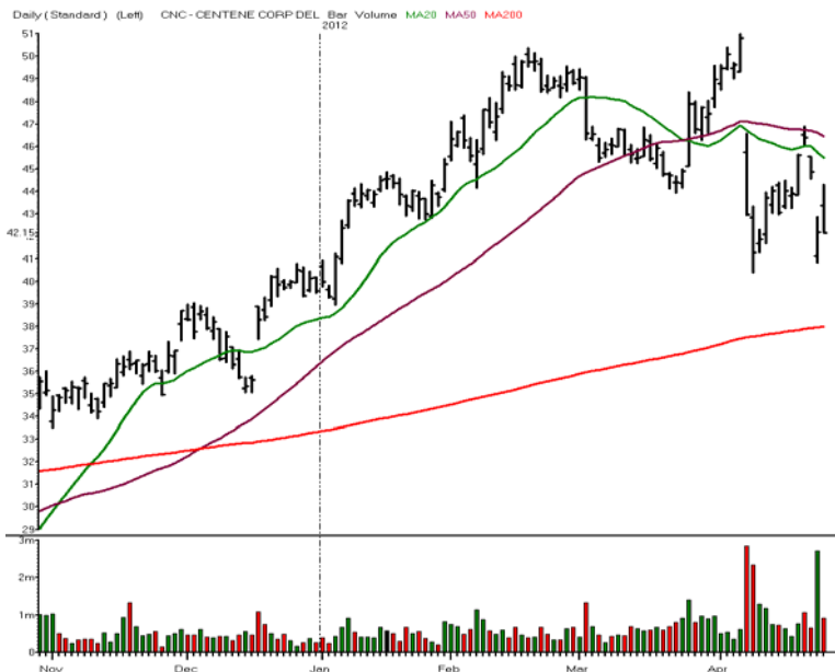
CENTENE CORP DEL

Symbol BRO Sector Insurance Brokers Sector Symbol $IUX.X Pattern Infield Fly Position Short Entry 26.41 Target 26.10