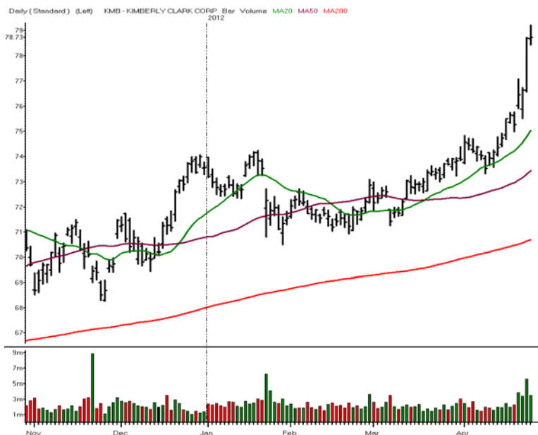
KIMBERLY CLARK CORP

Symbol KMB Sector Household Products Sector Symbol $CMR.X Pattern Infield Fly Position Short Entry 78.32 Target 77.90