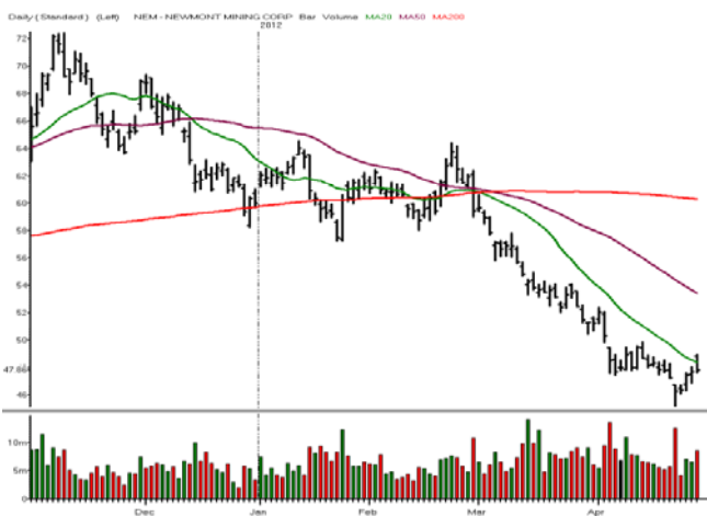
NEWMONT MINING CORP