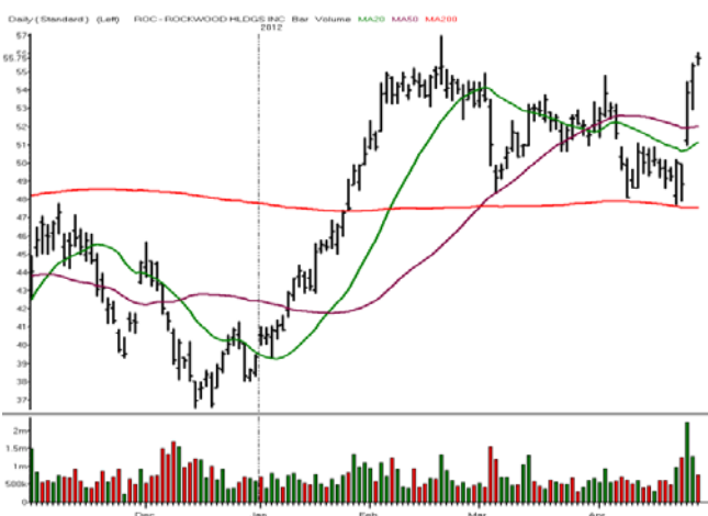
ROCKWOOD HLDGS INC