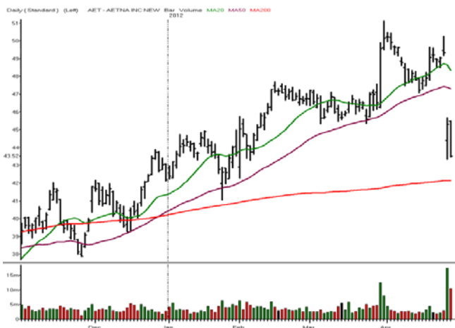
AETNA INC NEW