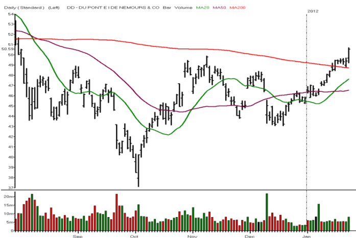
DU PONT E I DE NEMOURS & CO