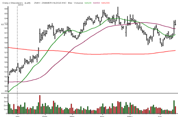
ZIMMER HLDGS INC