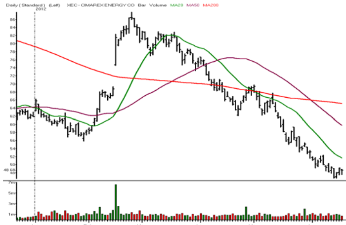
CIMAREX ENERGY CO