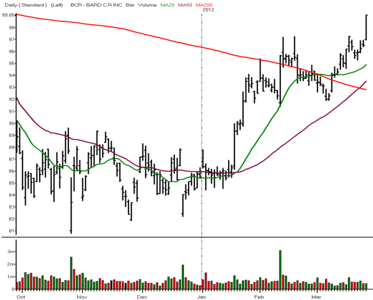
BARD C R INC